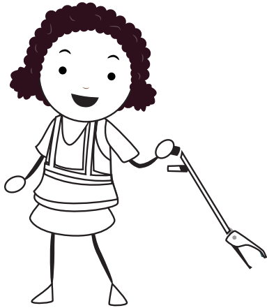
Pick up a piece of litter

Let's go explore and protect our planet! Each time you complete an activity, cut out the badge and color in the activity. Make sure you get your parents' permission before you start each activity.