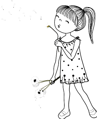
Make a wish with a dandelion