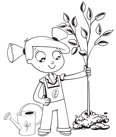
Plant a tree