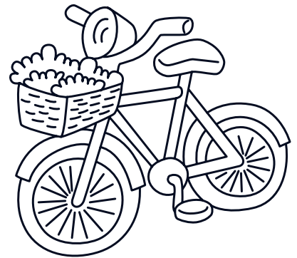
Go on a bike ride