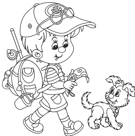
Take a nature walk