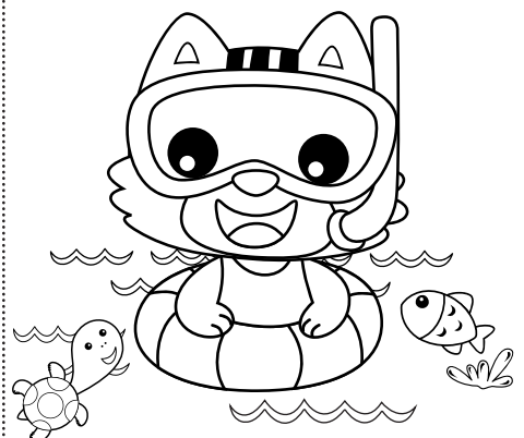
Go for a swim (in the ocean, a lake or river)